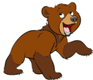
Brown Bear Newsletter

Stayed informed! Click and read your child's classroom newsletter below.