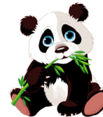
Panda Bear Newsletter