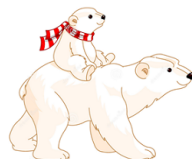
Polar Bear Newsletter