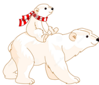
Polar Bear Newsletter