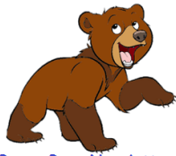
Brown Bear Newsletter

Click and read your child's classroom newsletter below.