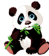
Panda Bear Newsletter